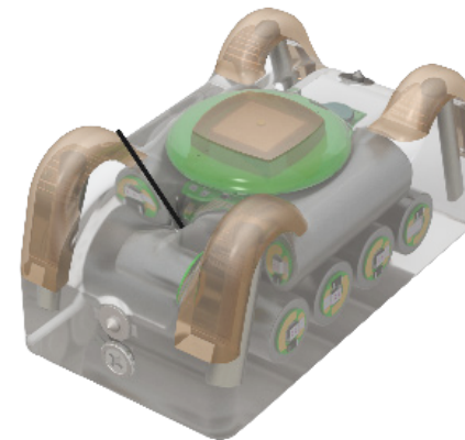
Model: SPLASH10-F-334/ BF-334/ 10-334 /

tags@wildlifecomputers.com WildlifeComputers.com +1 (425) 881-3048