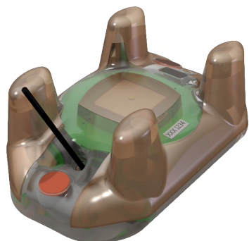
Model: SPLASH10-F-351/ BF-351/ 10-351