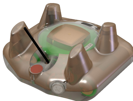
Model: SPLASH10-F-344/ BF-244/ 10-344