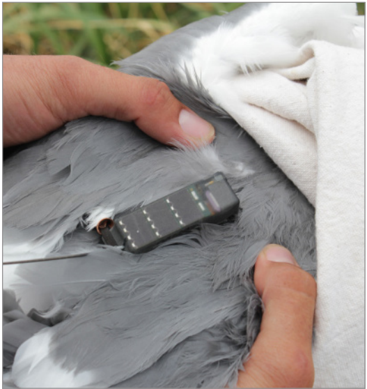
Rainier-S20 on Western Gull in Oregon Federal Bird Banding Permit #05271.

*Available with either harness loops or holes depending on your preference.